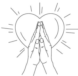
Dorothy Violet Boyd

Access Bedford was lucky enough to be gifted a donation which had been left in trust by Dorothy Violet Boyd. Dorothy was not known to Access Bedford or the wider Deaf community. The money gifted to us has been allocated to our outreach project, which allows us to use this money in a variety of ways. We can provide subsidised activities to our Deaf community and also offer British Sign Language learning opportunities to parents of Deaf children who may otherwise not be able to afford to pay for courses. This money allows us to bring our Community together, reduce social isolation and remove barriers.